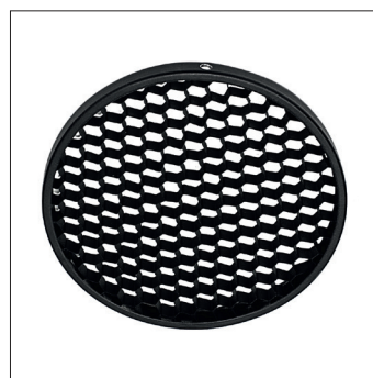
HCB honeycomb louver