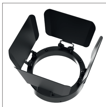
BDS barn doors shades

All current index numbers, lumen outputs, power consumption and many other technical information are available in our 2024 pricelist. Details on wireless lighting control systems on page number 896.